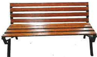
Example of Bench Seating Size 3200x500mm