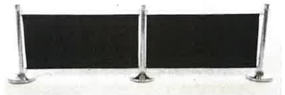
Example of Polyester Screen Barrier with top and bottom rails between Barrier Posts Barrier Height 638mm high between posts.