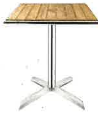
Example of Tables Sizes 600x600mm & 1200x600mm, 730mm High