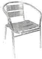
Example of Individual Seating Aluminium Stacking Chairs 450mm High