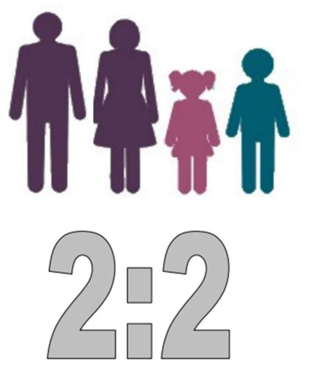
1 child under 4 and 1 between 4–7 years must be accompanied by 2 responsible adult/person (over 16 years).

Children aged between 4–7 years must be accompanied by a responsible adult/person (over 16 years), on a maximum of 1 Adult to 2 children ratio.