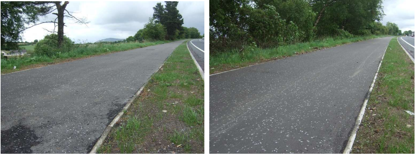
Foreglen Road, Ovil, Dungiven – Completed scheme.

The scheme provides a further 640 metres of shared footway and cycleway on the existing hard shoulder along this section of Foreglen Road. These works extend the existing provision of shared footways and cycleways along Foreglen Road and facilitate active travel in this area.