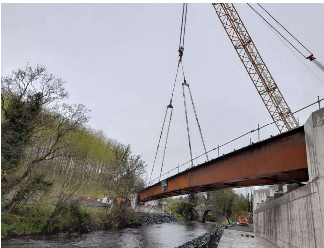
Beams being lifted in place for the Ardmore Road bridge.

Further information on the works and traffic management is available on the scheme website at: https://a6d2d.com/