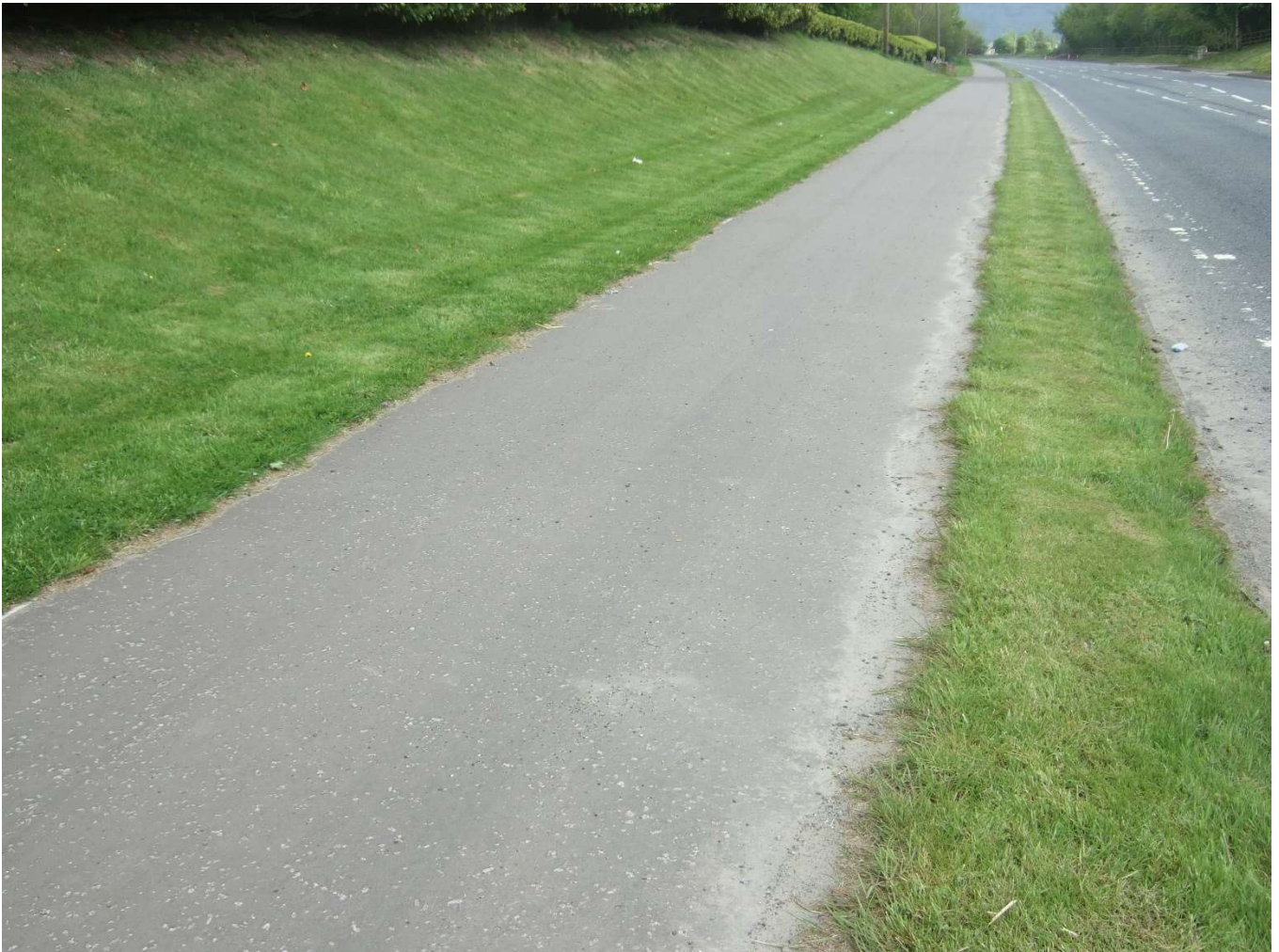
Foreglen Road, Owenbeg - Completed scheme May 2020

This scheme upgraded 300 metres of existing footway opposite the Owenbeg GAA facility to a shared footway and cycleway. It also provided an upgrade of a further 185 metres of existing footway adjacent to the Filling Station, opposite the junction of Feeny Road, to a shared footway cycleway. The completion of these sections provides active travel facilities on Foreglen Road from the junction with Feeny Road to the junction with Derrychrier Road, a distance of approximately 2.5km (1.5miles).