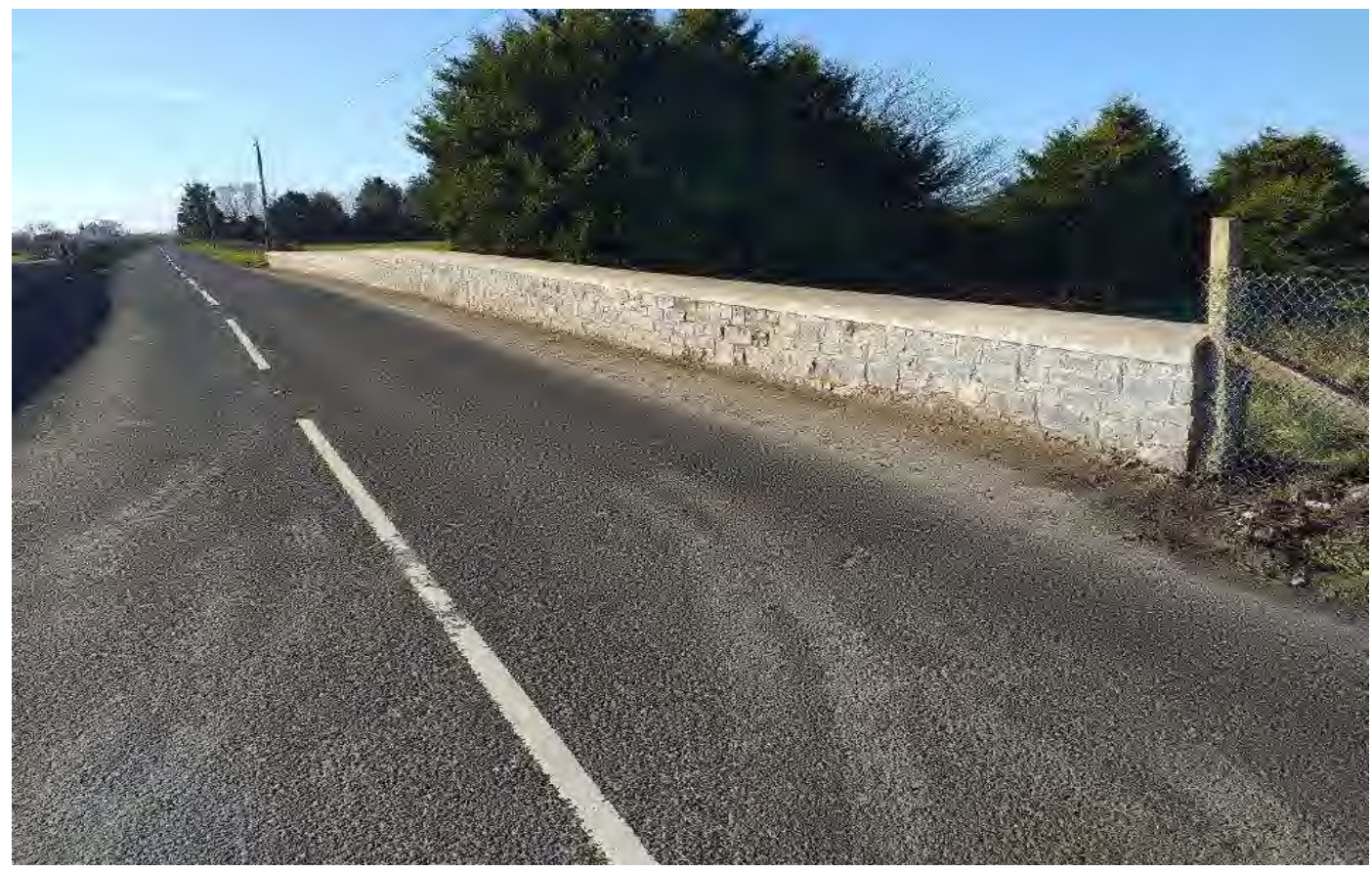
Completed scheme - Ballinlea Bridge, Ballycastle