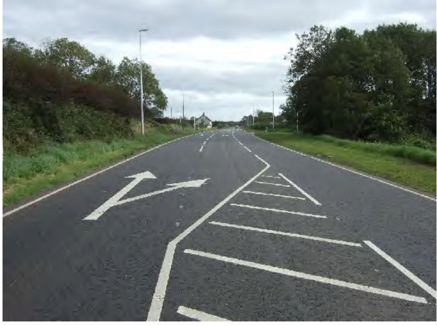
Completed B62 Ballybogy Road scheme at Revallagh