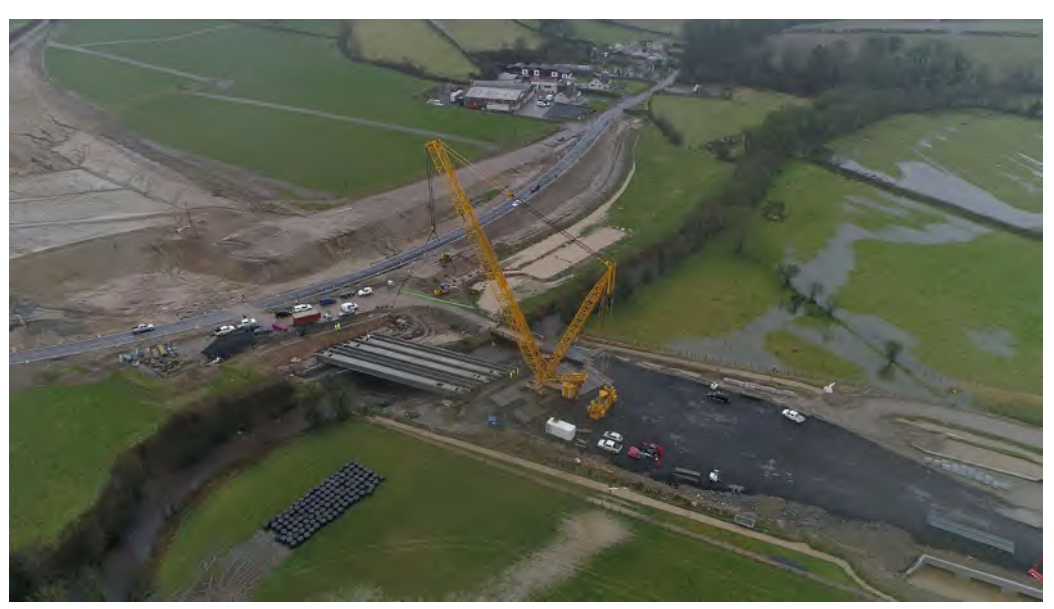
Beams being installed on the Owenrigh River Bridge

For further information on the works and Traffic Management is on the scheme website at: <u>https://a6d2d.com/</u>