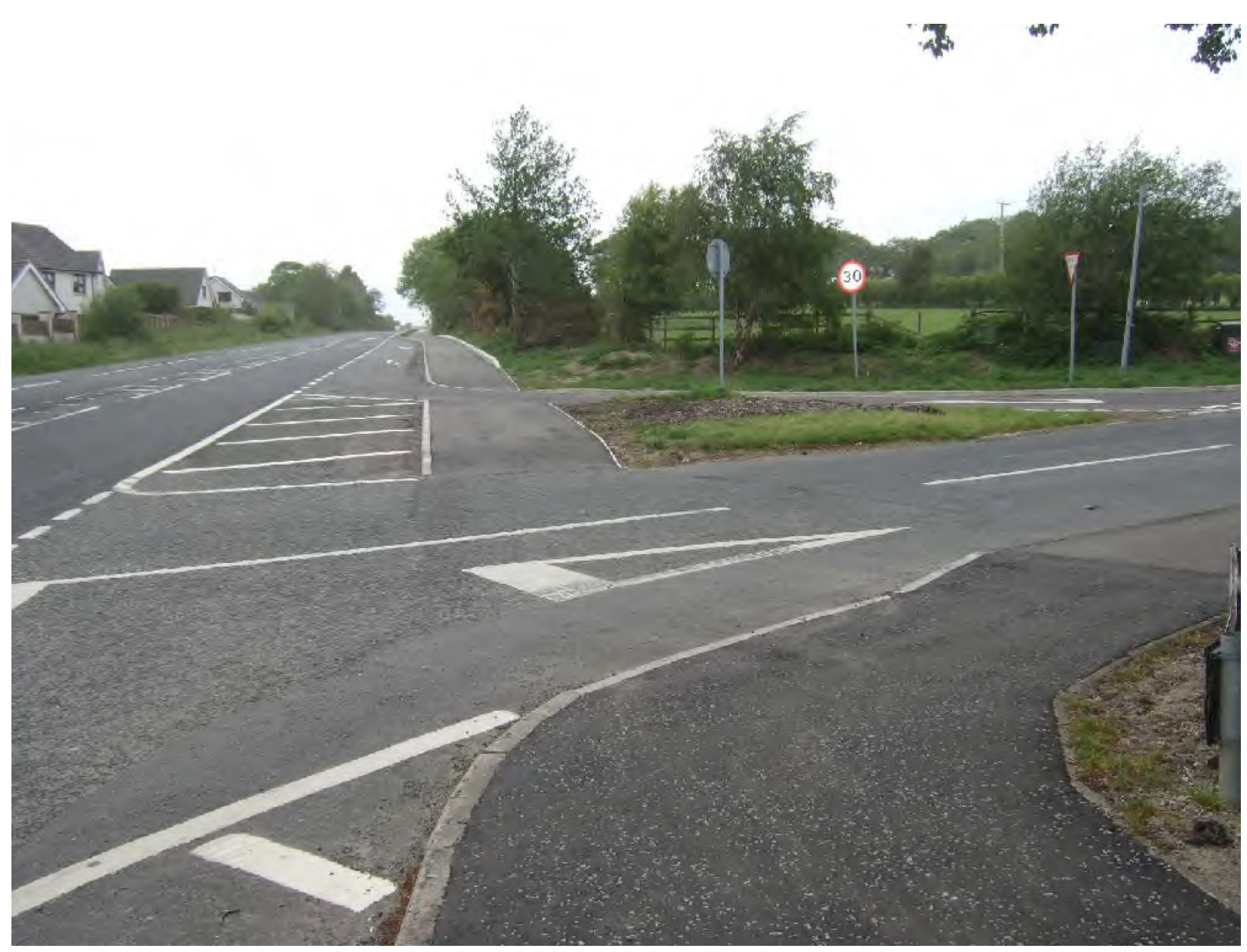
Foreglen Road, Dernaflaw - Completed Scheme

The scheme provided 980m of shared footway and cycleway on the existing hard shoulder along this section of Foreglen Road. These works have extended the existing provision of footways and cycleways at Dernaflaw and will facilitate active travel in this area.