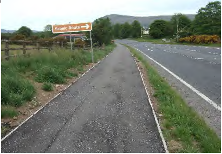
Foreglen Road, Owenbeg - Completed Scheme