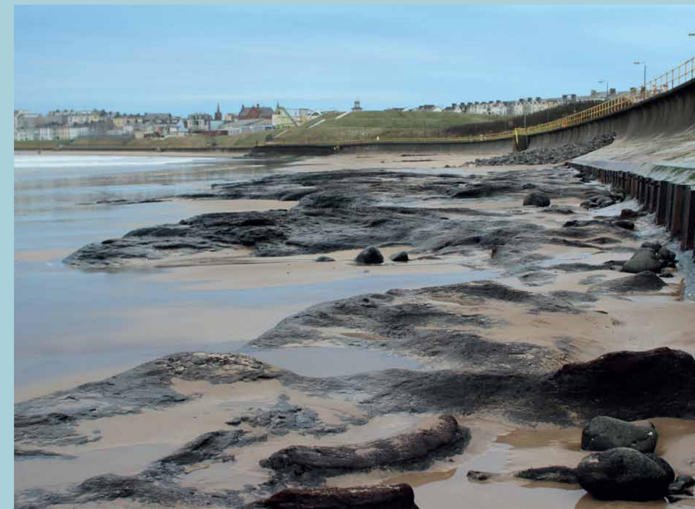
Fossilised peat beds at West Bay, Portrush