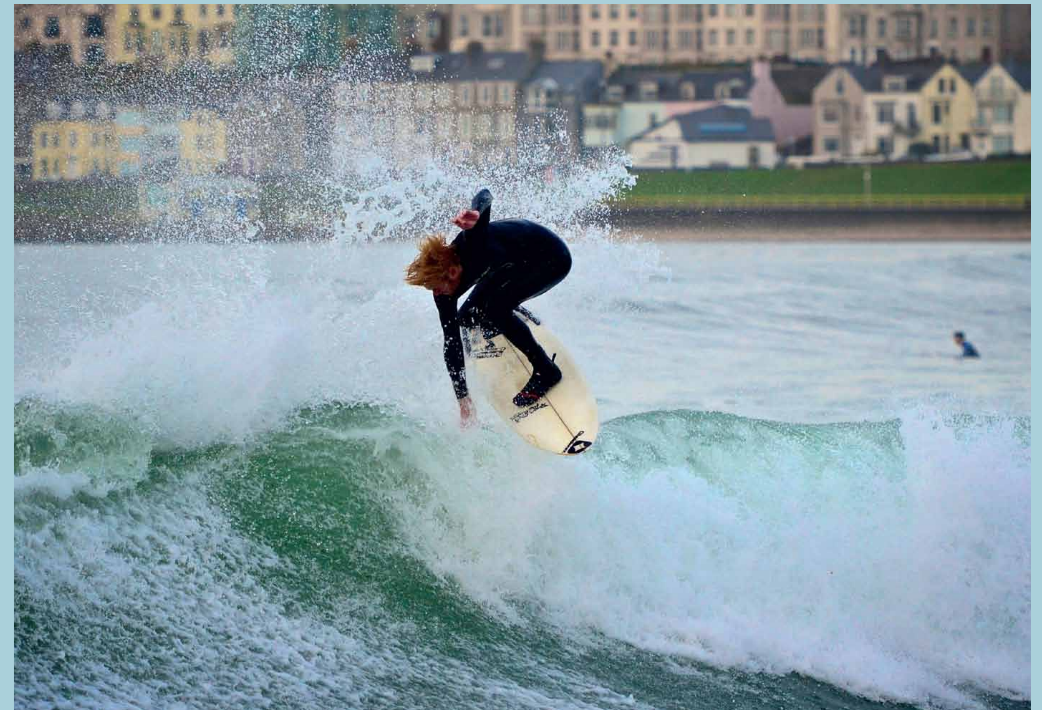
Surfing in West Bay

The West Bay is a geological Area of Special Scientific Interest. Beneath the sand are beds of fossilised peat (sometimes referred to as ‘turf’) containing evidence of Ireland’s post glacial history. Often exposed by storms, the peat (up to 5ms deep in places), contains preserved remains of plants (common reed) and trees (alder and birch) that grew in the area over 7,000 years ago when the sea level was lower. A wetter climate created a marsh, fen and later scrubby woodland habitat which eventually waterlogged to form peat.