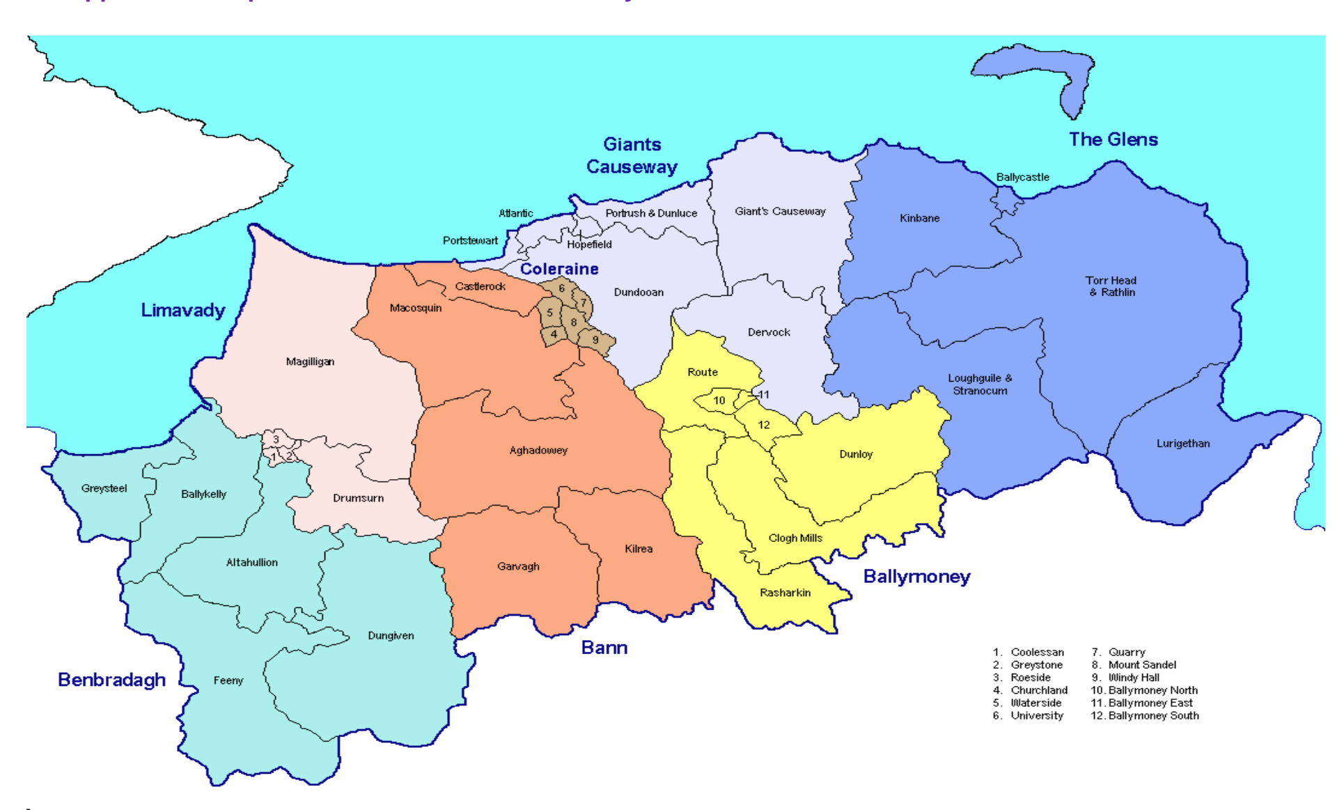
Appendix 5: Map of electoral wards in Causeway Coast and Glens