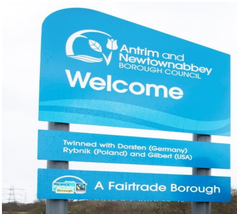
Derry City & Strabane District