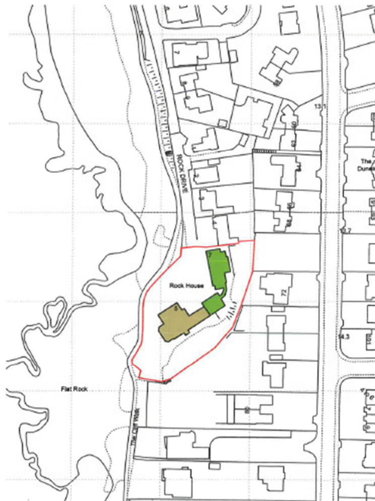
Site Location Map Scale 1:1250