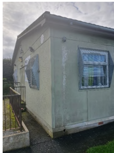
Figure 6 – End cap of guttering missing