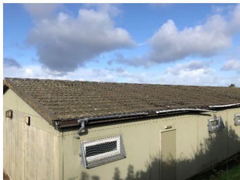
Figure 3 – View of roof construction

Roof would have originally been timber decked and overlaid with mineral felt. An additional cladding of steel profile sheeting at a later stage which is holding well.