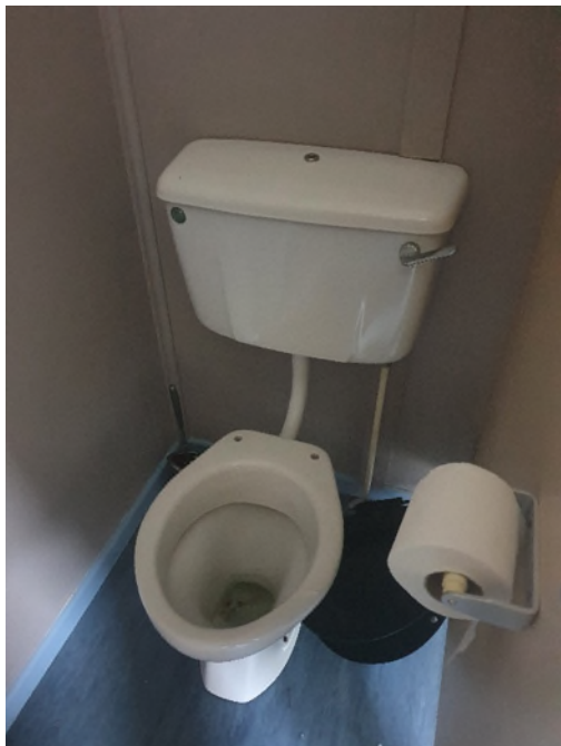
Figure 18 - broken toilet seat

Toilet facilities are in a serviceable condition and the sanitary ware could potentially be re-used (Figure 14 above). Minor repairs are required – missing toilet seats and the like to improve facilities. The inclusion of a disabled facility with baby changing bed (Figure 17) is of great benefit. All areas again should be re-decorated to freshen up and prolong life.