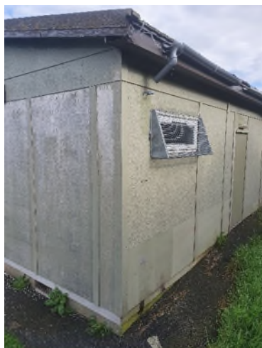
Figure 5 – Missing section of guttering

A number of defects were noted to the rainwater goods such as those shown in Figures 3-6 indicating sections of the guttering is missing and downspouts missing. As a result of these defects rainwater is not being effectively diverted away from the building and this is likely to result in moisture ingress.