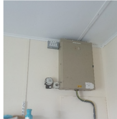
Figure 16 – Kitchen Ceiling

Access to the roof void was not possible due to restricted access to determine level of insulation, if any.