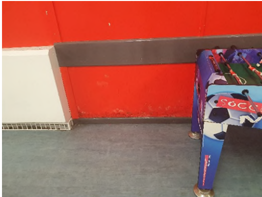
Figure 11 – Damp penetration games room

All internal walls are of timber construction and sheeted in plasterboard. All are in reasonable condition with some signs of wear.