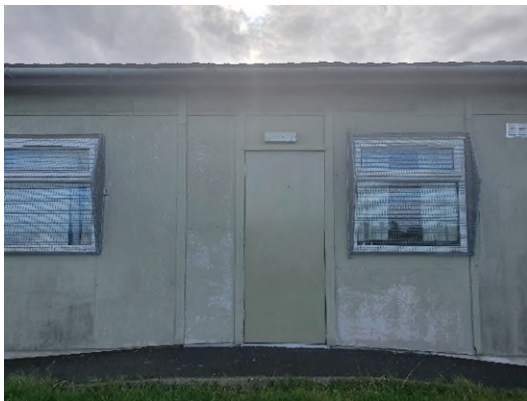
Figure 1 – Exterior walls requiring re-decoration

A full external re-decoration would prolong useful life of building and avoid any costly repairs due to water ingress