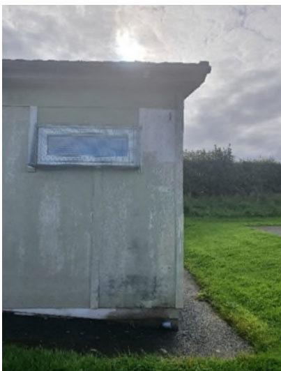
Figure 13 – Missing Downspout

Damp penetration was evident in several locations throughout the property. There is no major damage at present, but if remedial action is not taken promptly this will continue to worsen and result in structural damage. This can be corrected by rainwater goods repairs and external decoration.