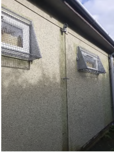
Figure 7 – High Level windows