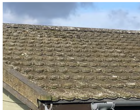
Figure 4 – Roof covering

Roof covering is generally sound with no evidence of leaks within the internal fabric of building.