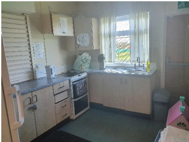
Figure 17 – Condition of existing kitchen

The kitchen is extremely dated and complete replacement is recommended (Figure 17 below). Re-decoration required in line with remainder of the building. Additional power sockets could be installed to avoid trailing leads.