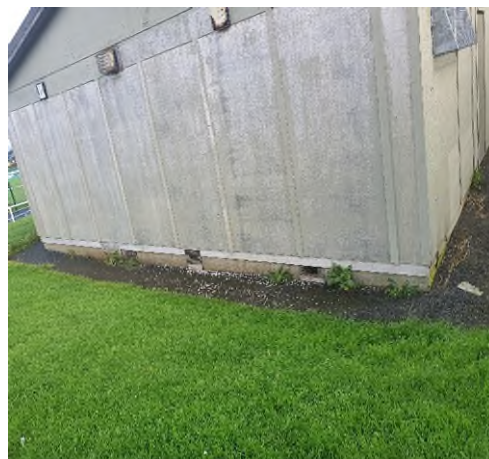
Figure 2 – Rear exterior wall requiring re-decoration