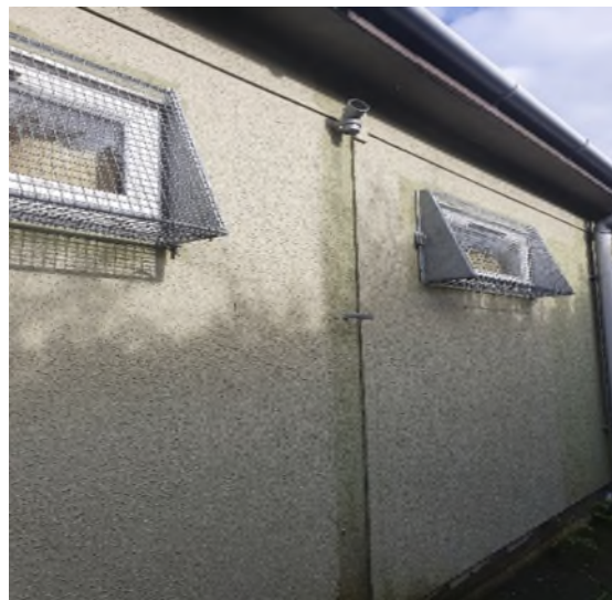
Figure 14 – Missing Downspout