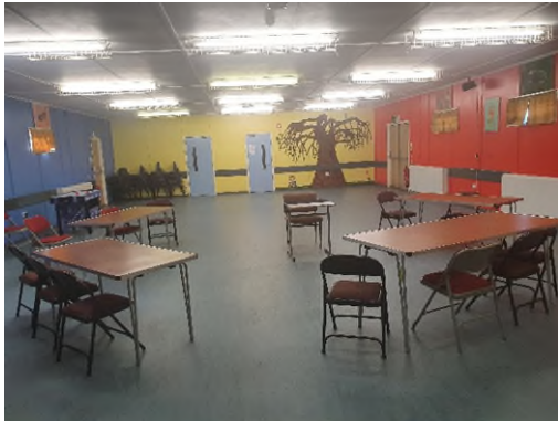
Figure 15 – Main hall ceiling

Ceilings throughout are constructed in timber joints with plasterboard sheeting and decorated. These are in good condition and have been well maintained. There is no evidence of damp staining due to roof leaks, as previously mentioned.