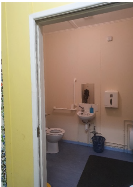
Figure 19 – disabled toilet