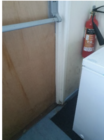
Figure 12 – Damp penetration kitchen

Damp penetration was evident in several locations throughout the property. There is no major damage at present, but if remedial action is not taken promptly this will continue to worsen and result in structural damage. This can be corrected by rainwater goods repairs and external decoration.