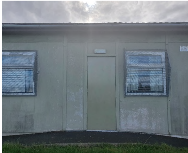
Figure 8 – Windows