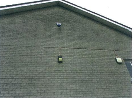
External Emergency Luminaire