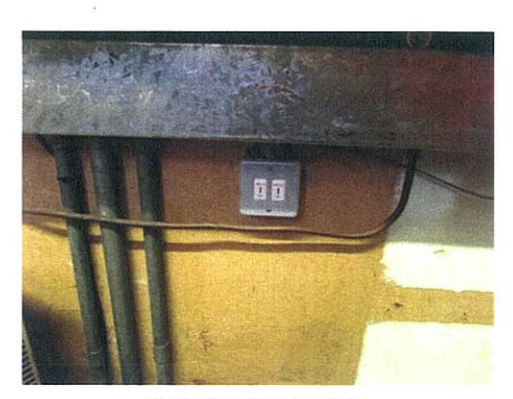
Galvanised Steel Conduit