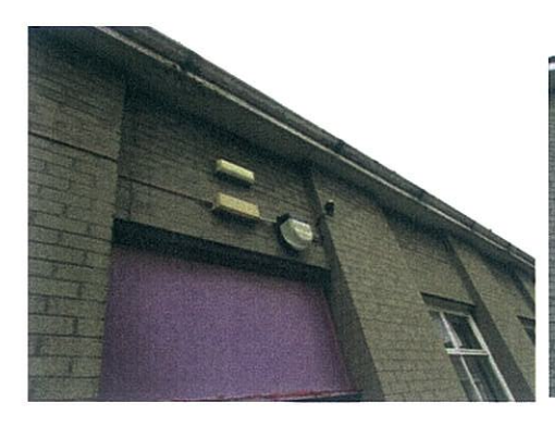
External Emergency Luminaire