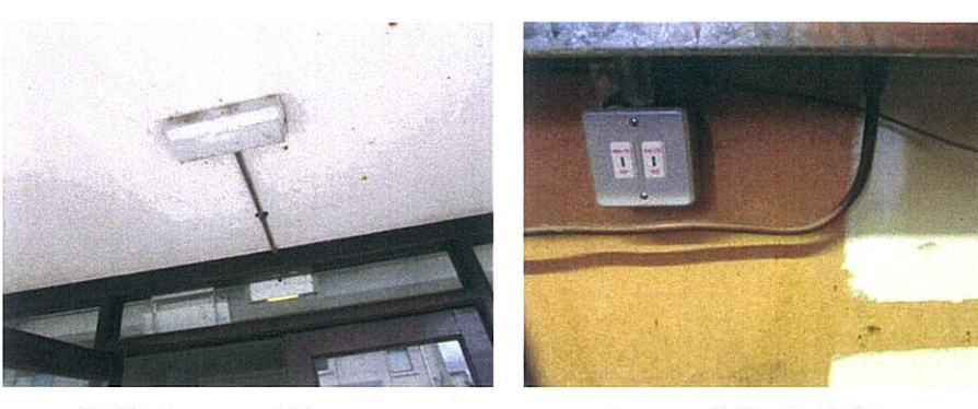
Corridor Emergency Lighting

Whereas the internal emergency lighting installation (mostly surfacewired) appears adequate c/w key test switch facilities we are concerned that due to age and condition of luminaries that the external emergency lighting may not perform as expected.