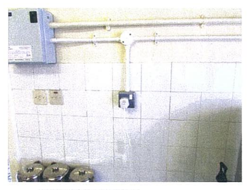
PVC Conduit Installation

Generally the power is supplied via 100mm x 50mm trunking from which power to outlets is wired in both galvanised steel and pvc conduits.